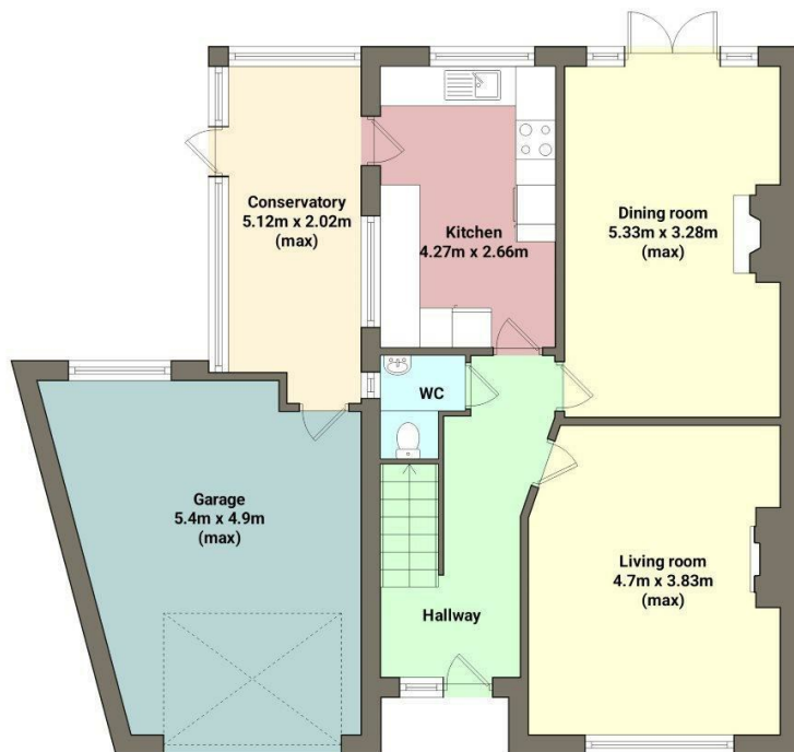
Ground floor Area: 88.73 m 2