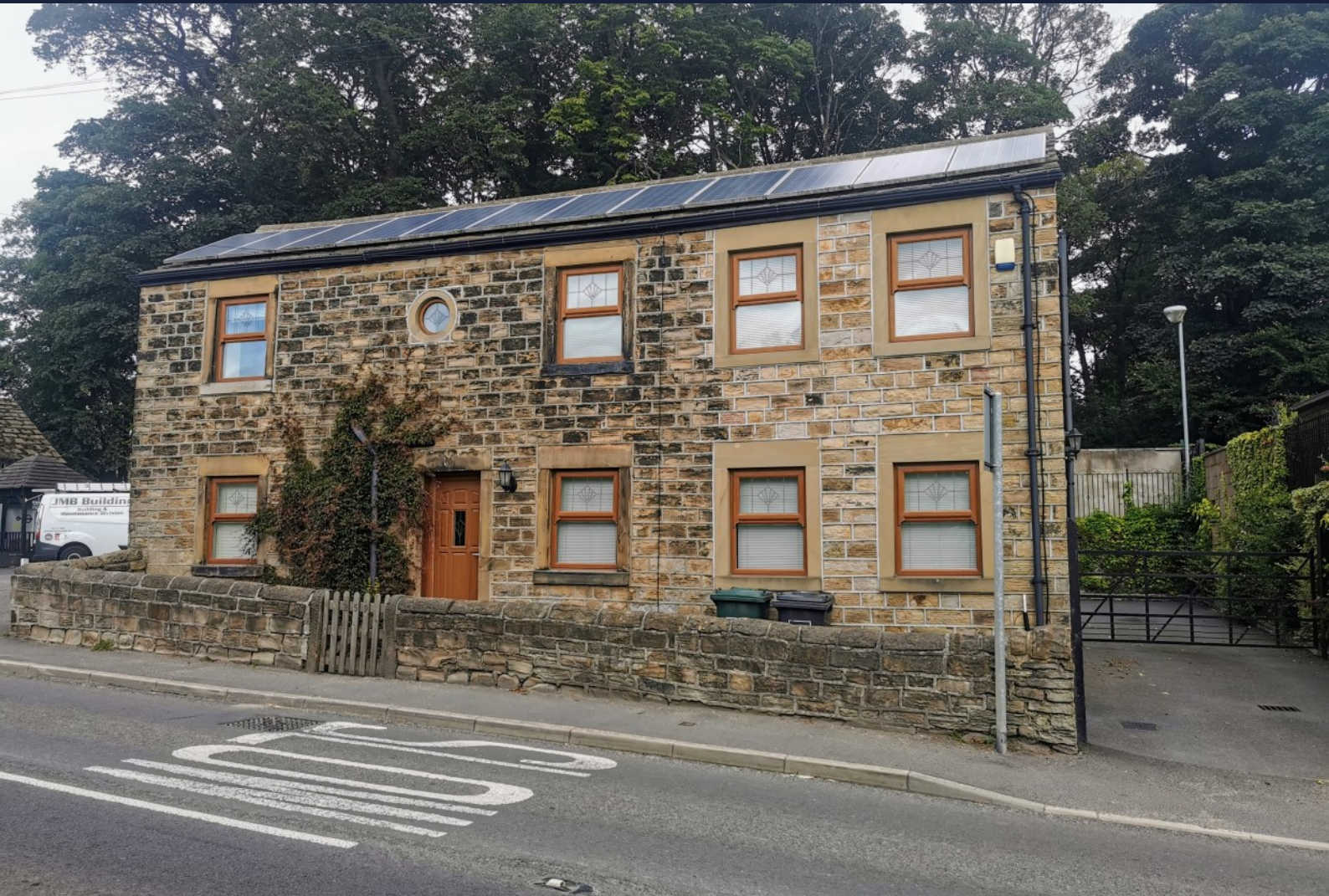
Rose Cottage, 259 Barnsley Road, Flockton, WF4 4AL