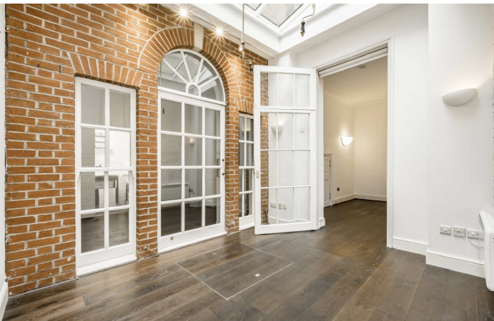
Bruton Place, W1J