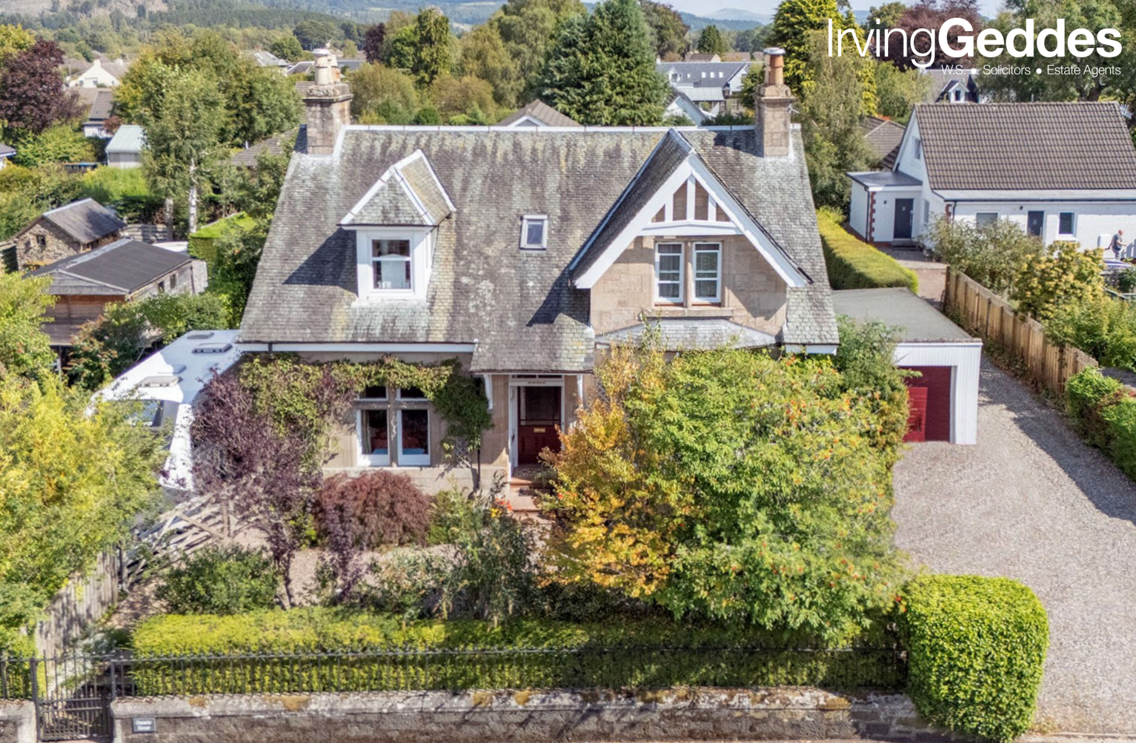
ONTARIO HOUSE, DALGINROSS, COMRIE, PH6 2HB