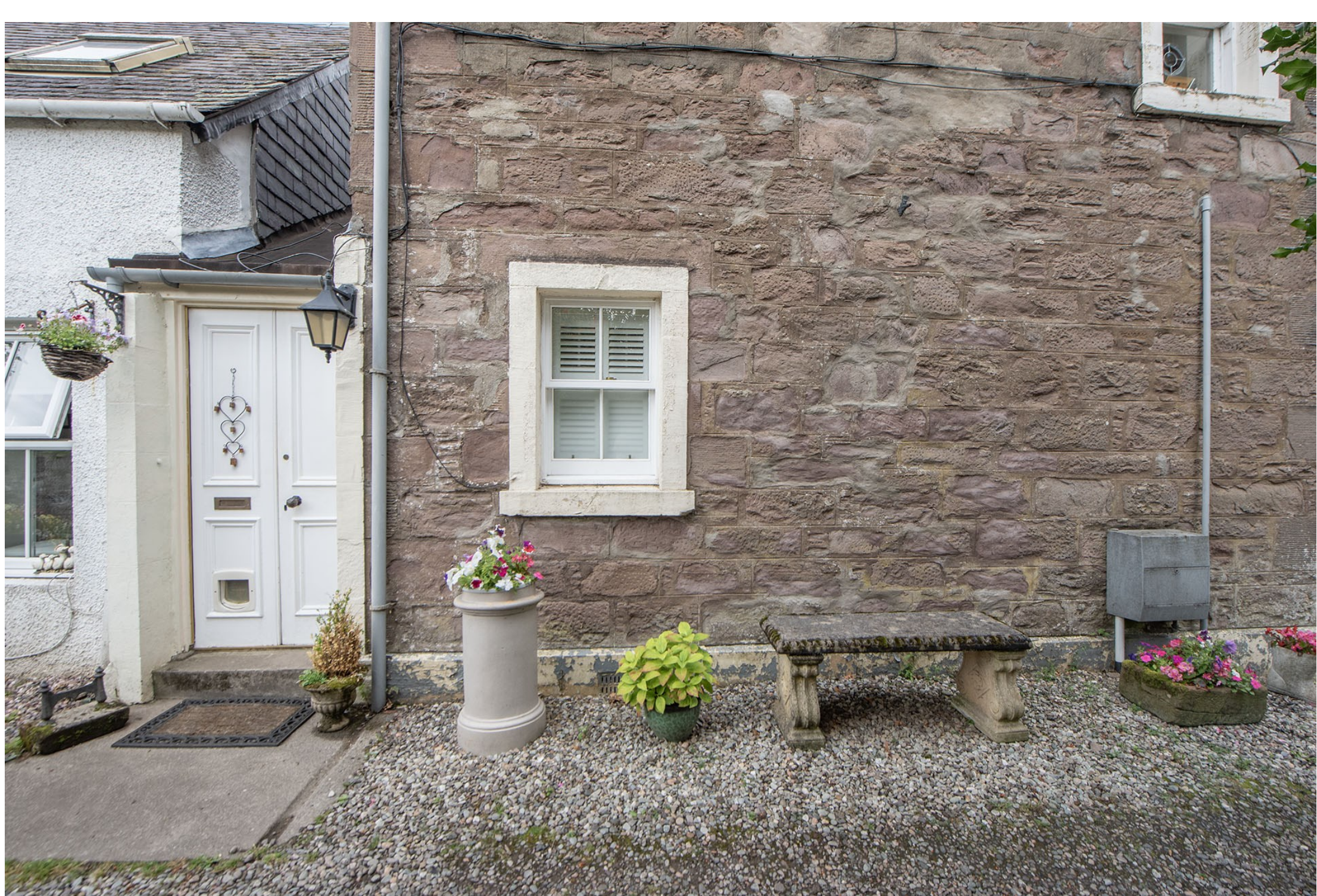
2 KINTYRE, DALGINROSS, COMRIE, PH6 2DG