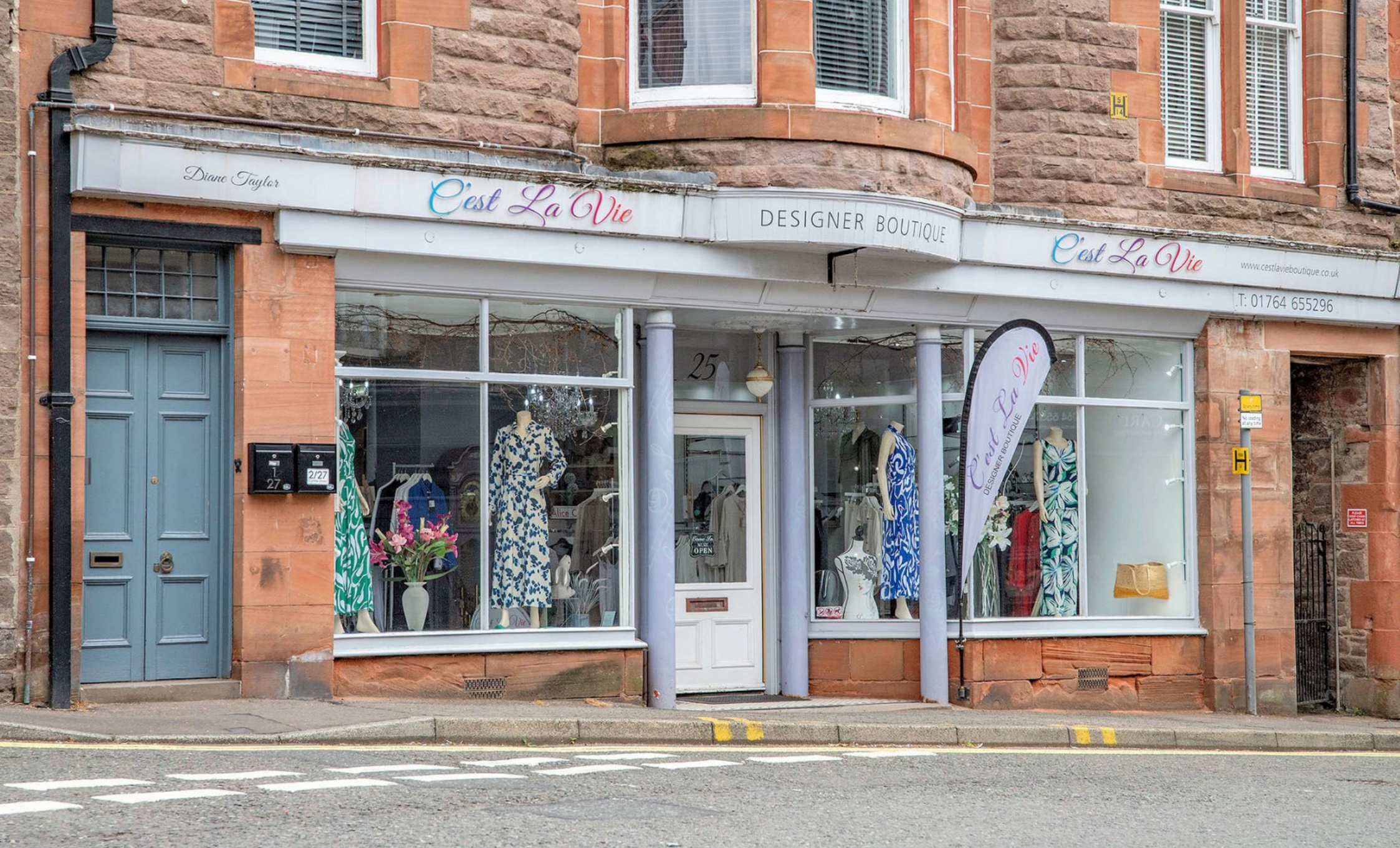
RETAIL SHOP, 25 COMRIE STREET CRIEFF, PH7 4AX