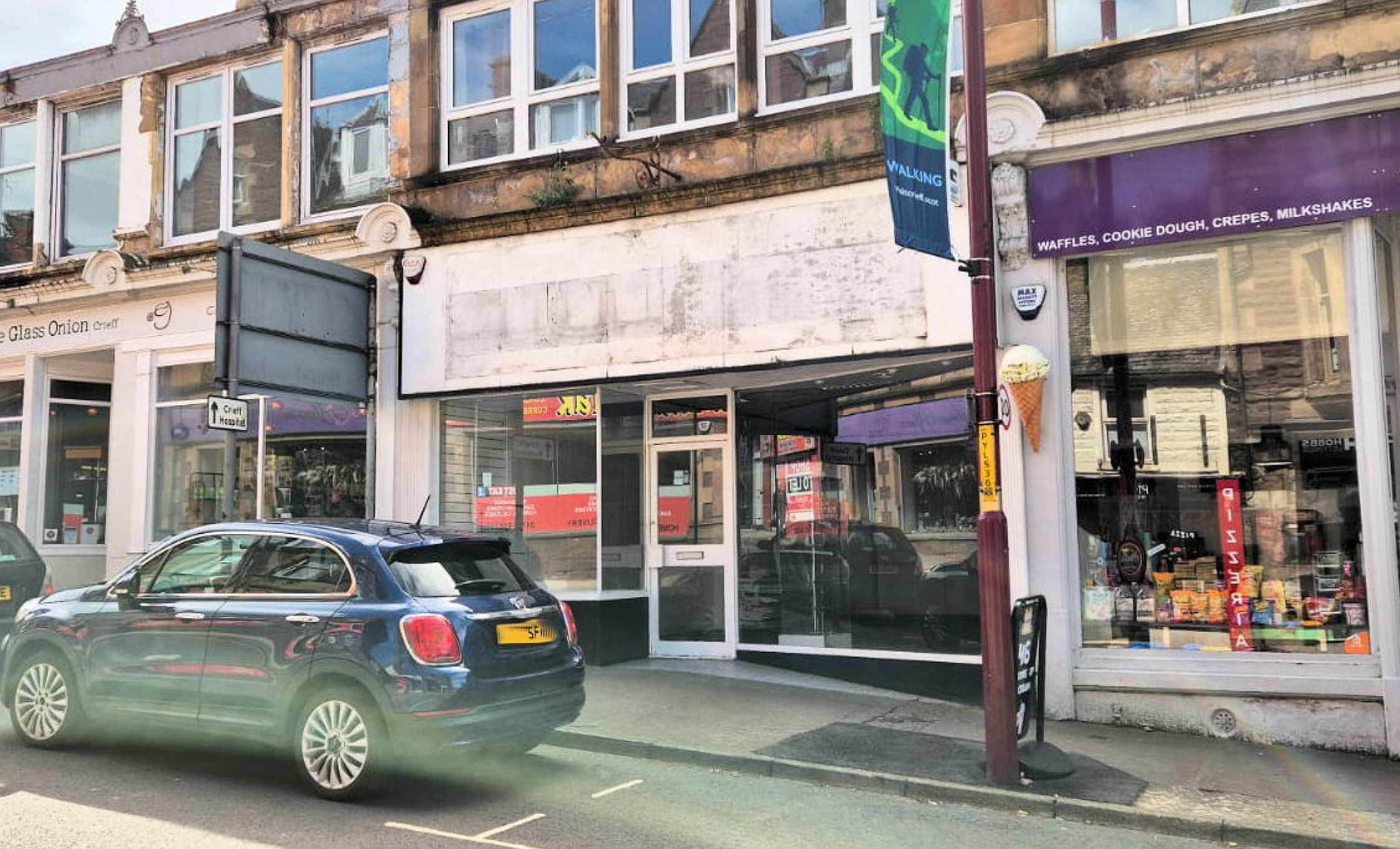
RETAIL SHOP, 22 WEST HIGH STREET CRIEFF, PH7 4DL