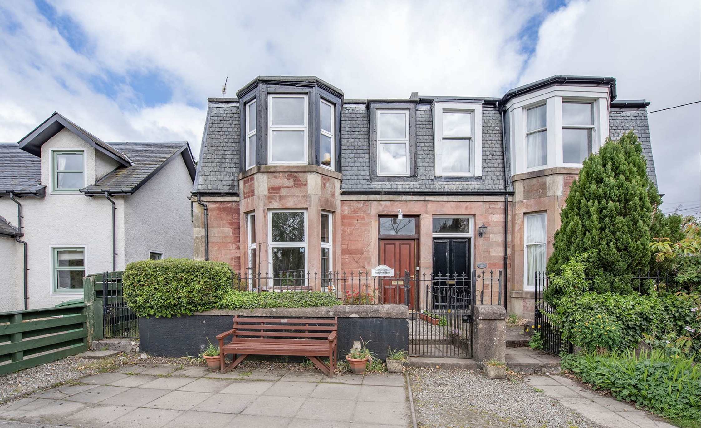
THE LIMES ANCASTER LANE, COMRIE, PERTHSHIRE, PH6 2DT