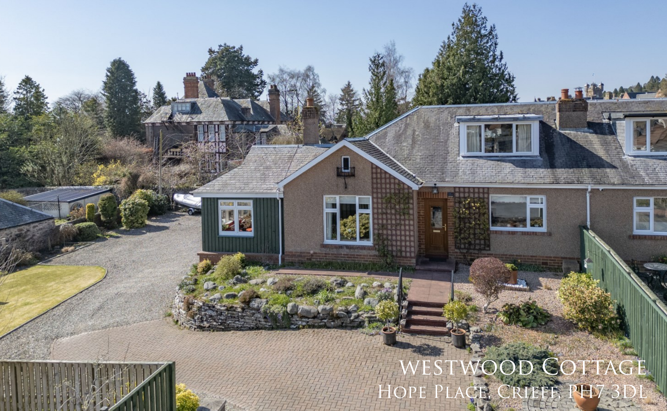
WESTWOOD COTTAGE HOPE PLACE, CRIEFF, PH17 3DL