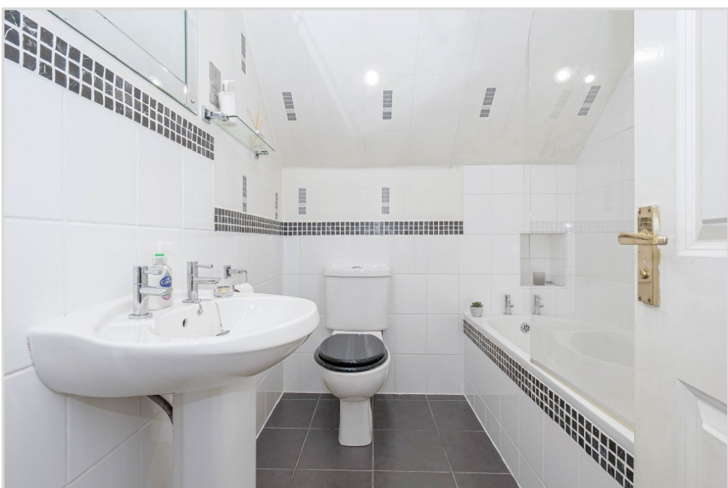
These particulars are believed to be correct, but their accuracy is not guaranteed and they do not form part of any contract. All measurements are approximate only.