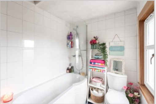
These particulars are believed to be correct, but their accuracy is not guaranteed and they do not form part of any contract. All measurements are approximate only.