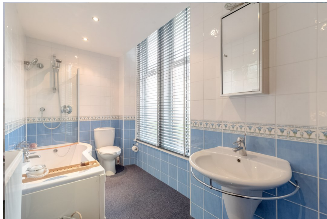
Apartment 2, Newstead, Ancaster Road, Crieff PH7 4AL