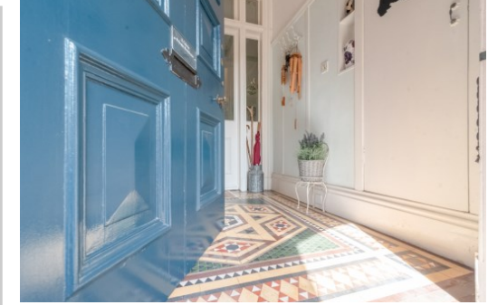
Apartment 2, Newstead, Ancaster Road, Crieff PH7 4AL