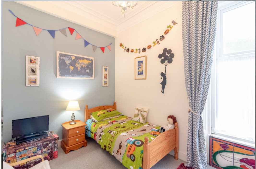
Apartment 2, Newstead, Ancaster Road, Crieff PH7 4AL