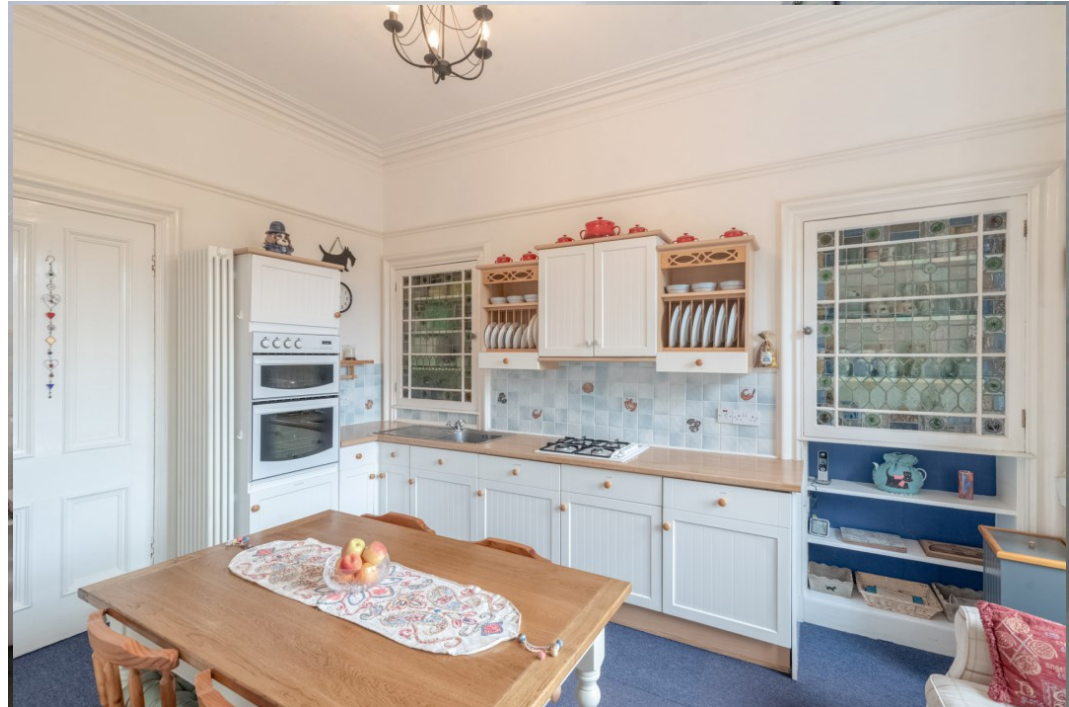
Apartment 2, Newstead, Ancaster Road, Crieff PH7 4AL