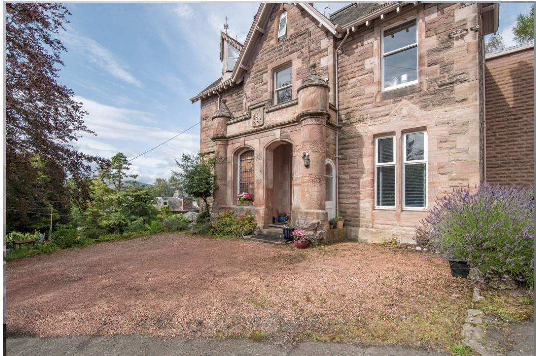
Apartment 2, Newstead, Ancaster Road, Crieff PH7 4AL