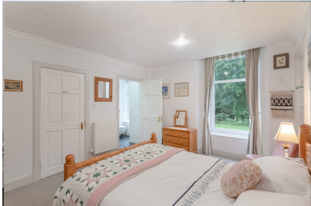
Apartment 2, Newstead, Ancaster Road, Crieff PH7 4AL