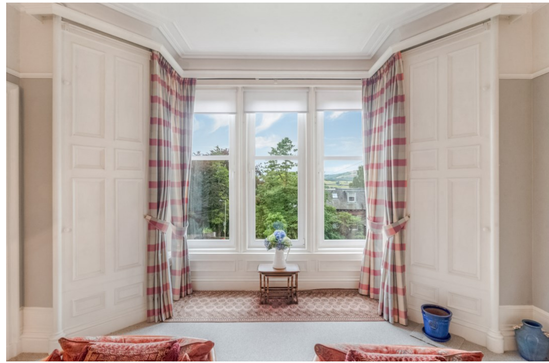
Apartment 2, Newstead, Ancaster Road, Crieff PH7 4AL