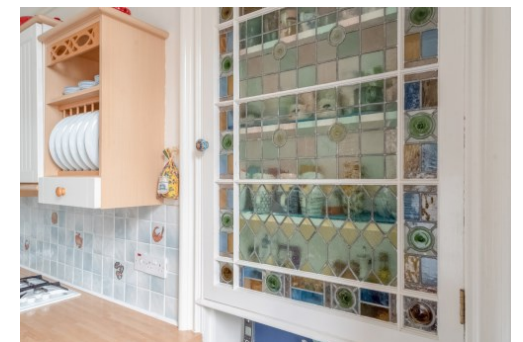
Apartment 2, Newstead, Ancaster Road, Crieff PH7 4AL