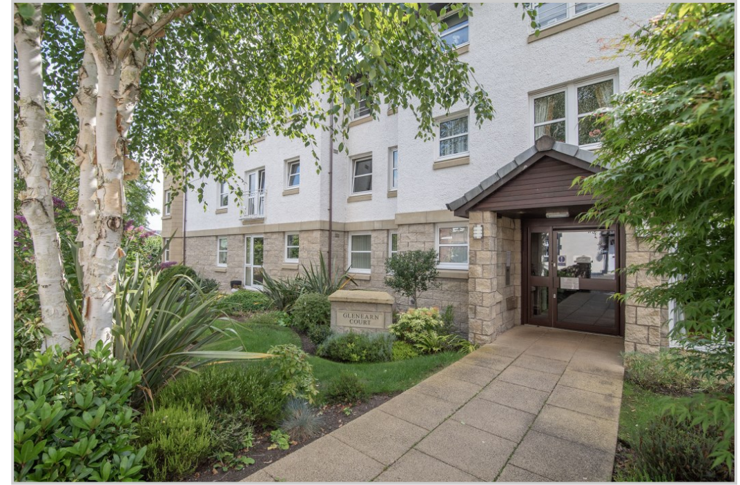
These particulars are believed to be correct, but their accuracy is not guaranteed and they do not form part of any contract. All measurements shown are approximate only.