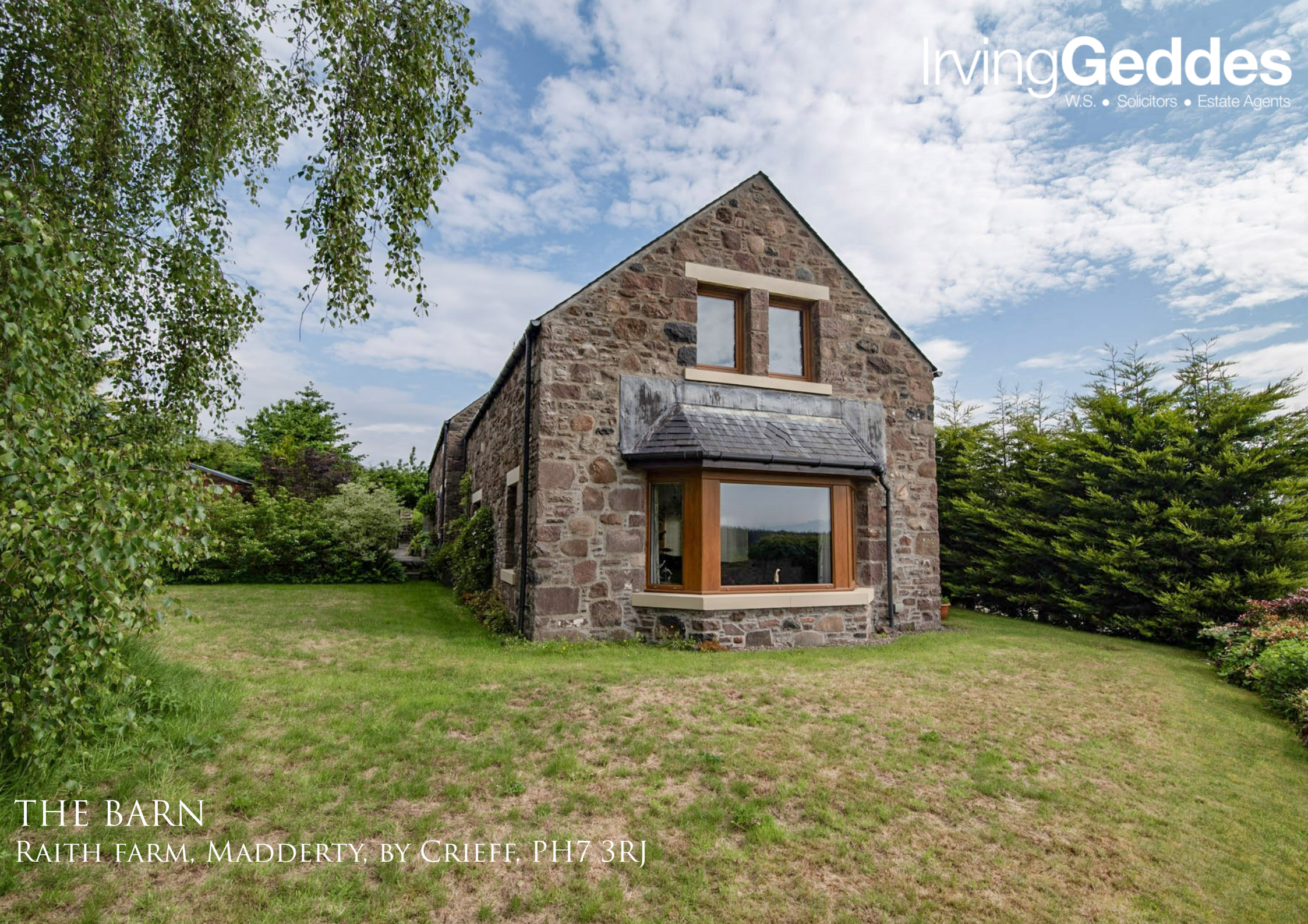
THE BARN RAITH FARM, MADDERTY, BY CRIEFF, PH7 3RJ