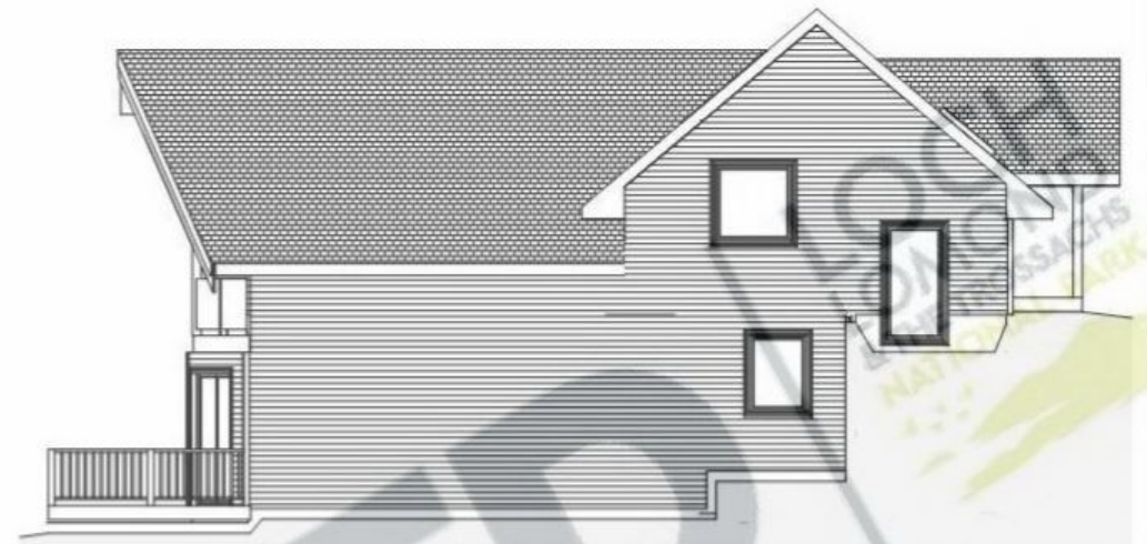
Elevation To North East