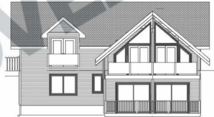
Elevation To South East