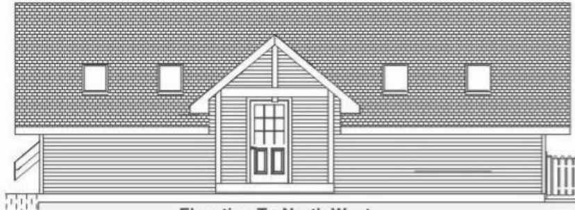
Elevation To North West (To Access Road)

https://eplanning.lochlomond-trossachs.org/OnlinePlanning/applicationDetails.do?activeTab=documents&keyVal=P68XF7SIKKW00