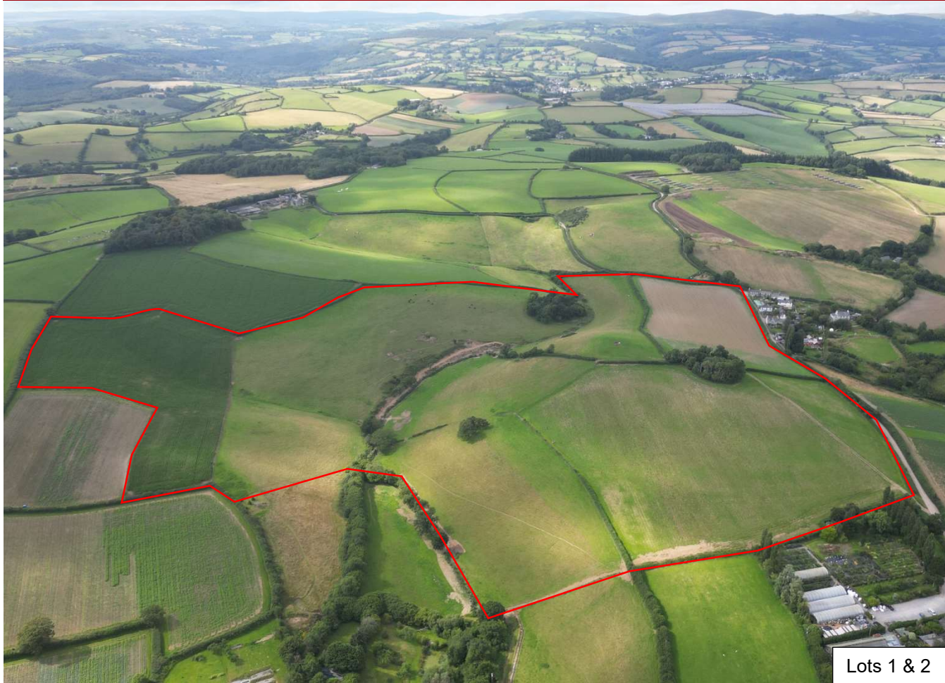
Lots 1 & 2