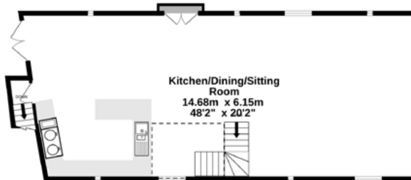
1st Floor 89.0 sq.m. (958 sq.ft.) approx.