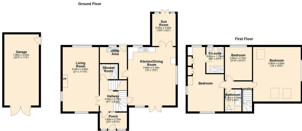
Railway crossing cottage, Whitbeck

Corrie and Co aim to sell your property, at the best possible price, in the shortest possible time. We have developed a clear marketing strategy, over many years, to ensure your property is exposed to all social media platforms, Rightmove, Zoopla and our own Corrie and Co website.