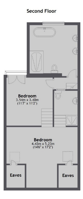
Total area: approx. 214.5 sq. metres (2308.6 sq. feet)

Chard Fulham 656 Fulham Road, London, SW6 5RX 020 7384 1400 fulhamlettings@chard.co.uk