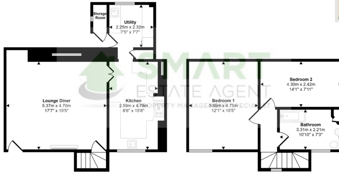
Ground Floor Approx 53 sq m / 571 sq ft

Approx Gross Internal Area 94 sq m / 1012 sq ft