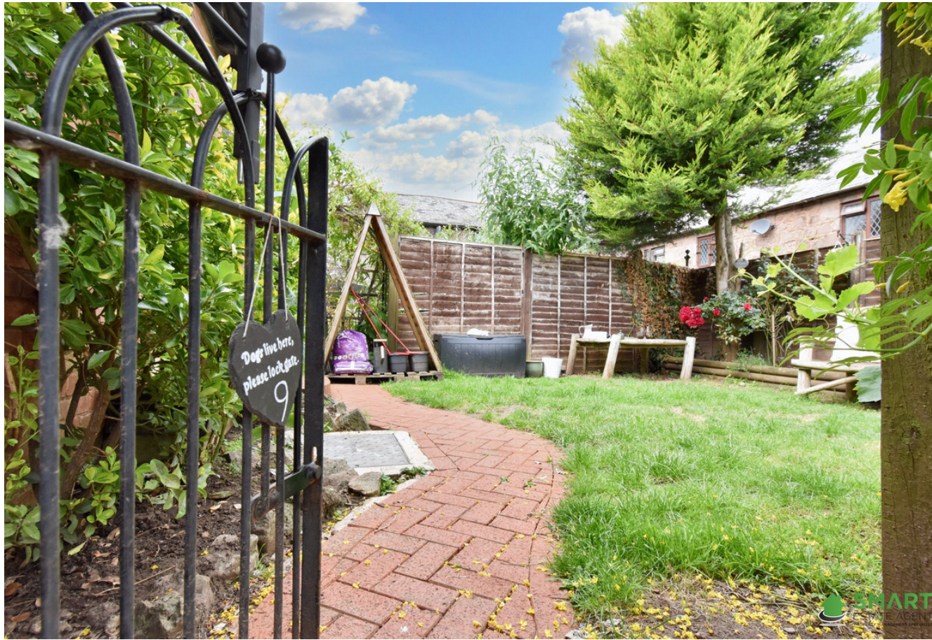
Charming Cottage in Broadclyst