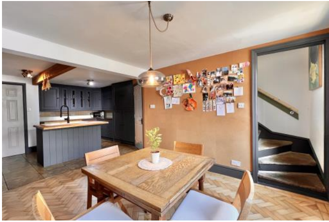
BREAKFAST KITCHEN 4.6 x 4.0m (14'11 x 13'1)