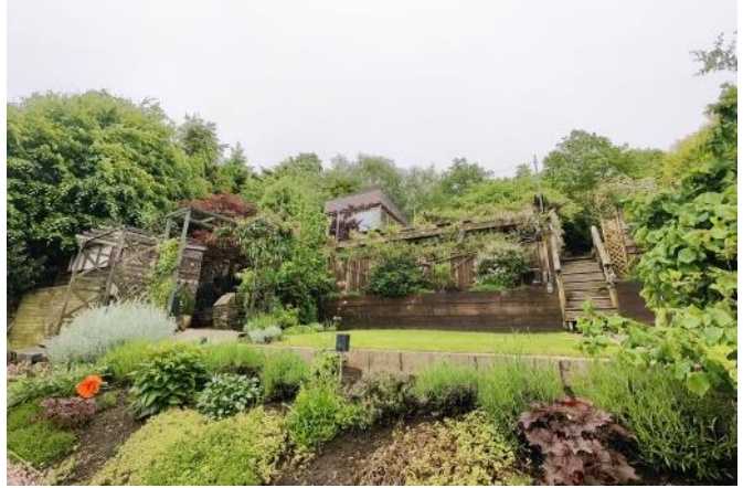
From the garden, steps lead up to the