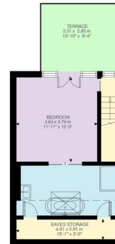
Second Floor 314 ft²