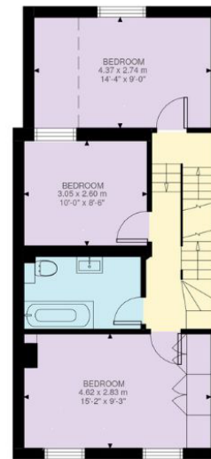
First Floor 524 ft²