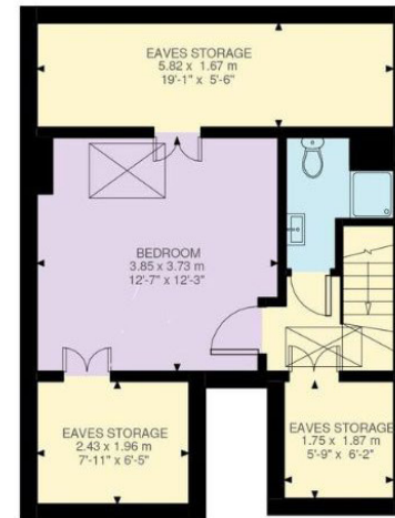
Second Floor 228 ft²