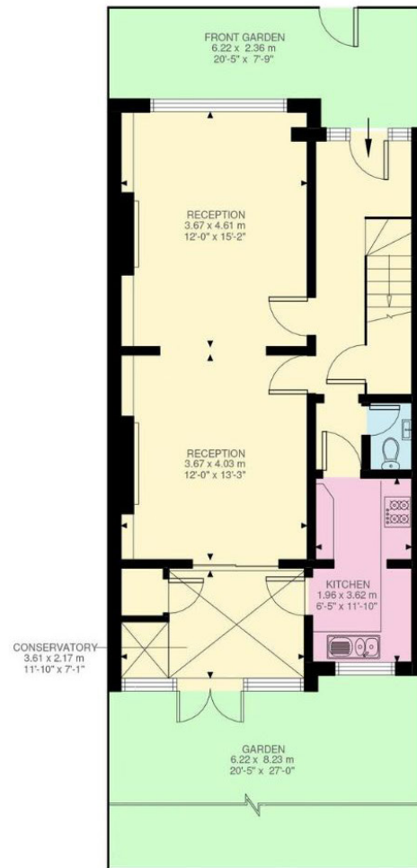
Ground Floor 671 ft²