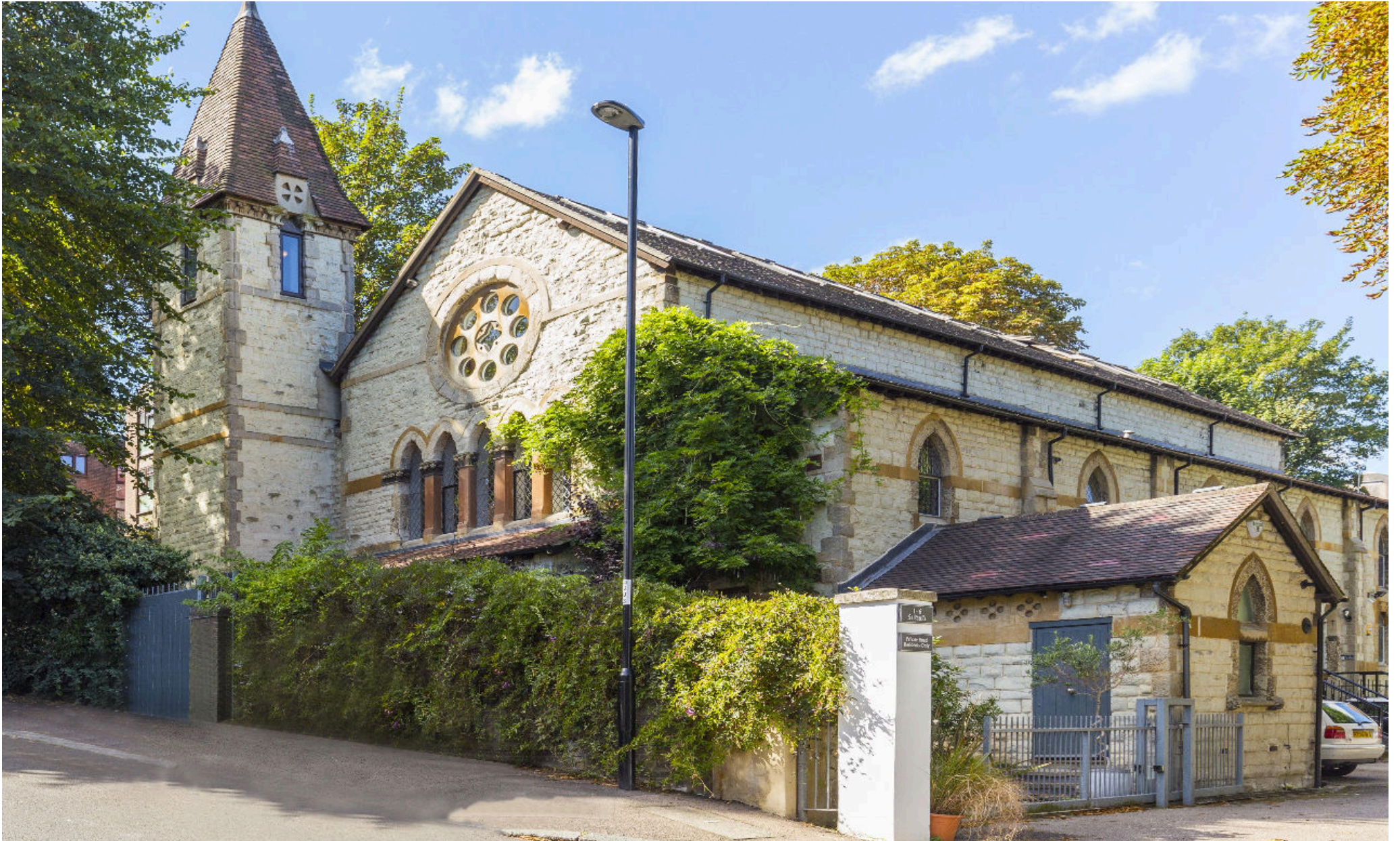
St. Paul's Conversion, Taymount Rise SE23