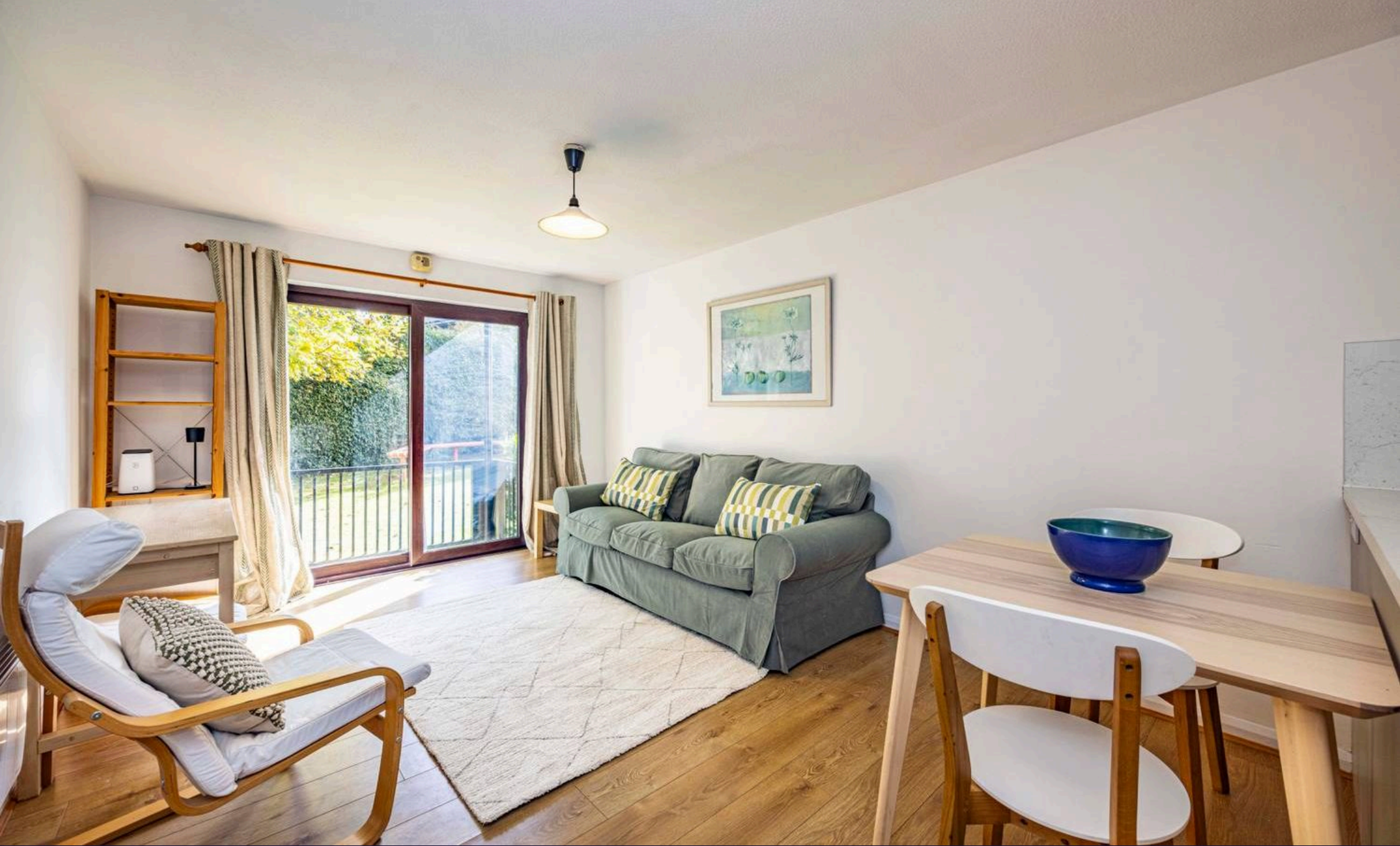
Flamingo Court, Nottingham £895 pcm