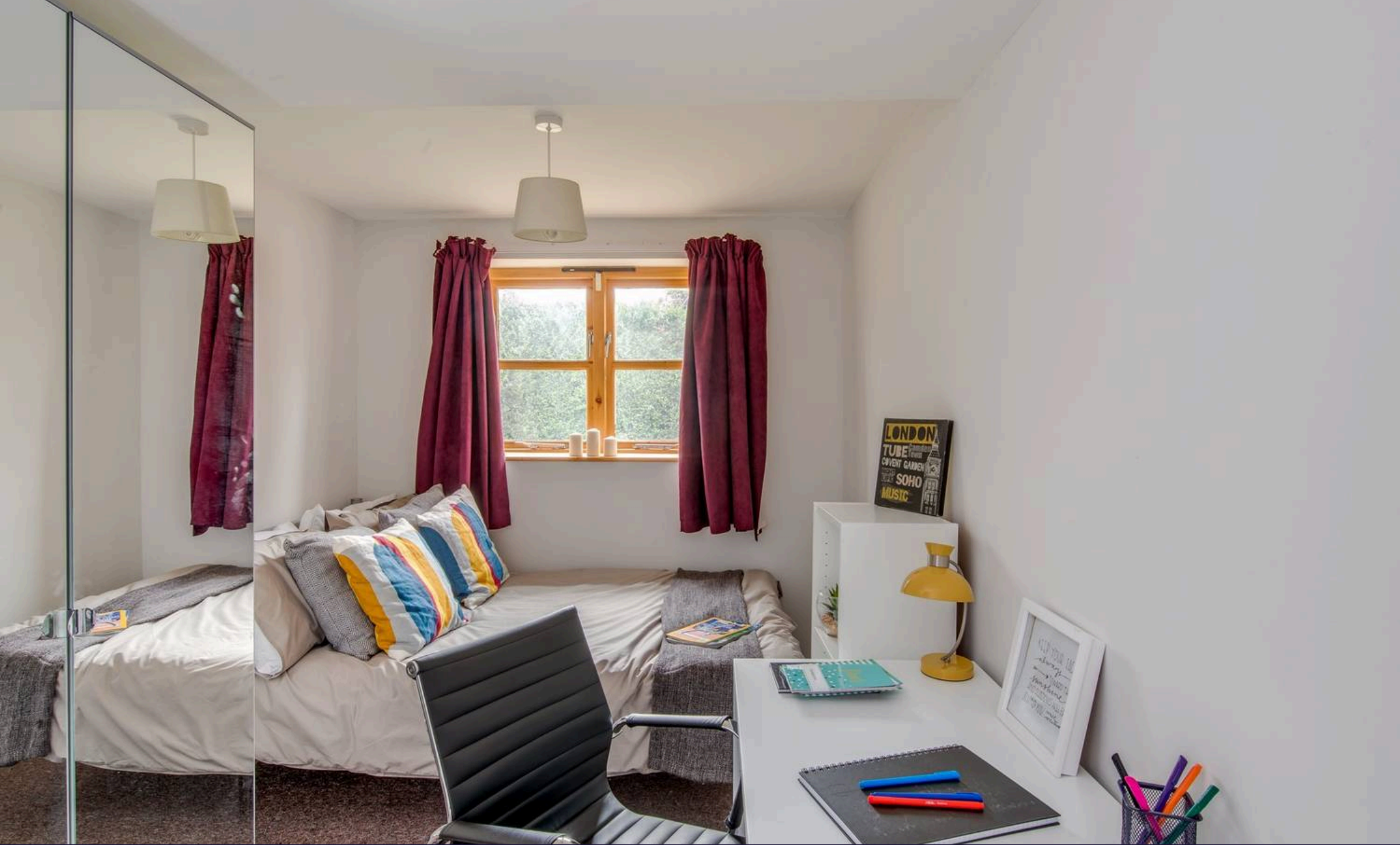
Middleton Boulevard, Nottingham £586 pcm