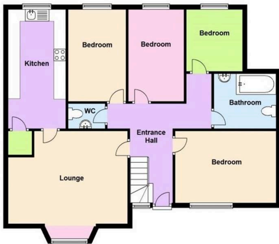
Ground Floor Approx. 934.7 sq. feet