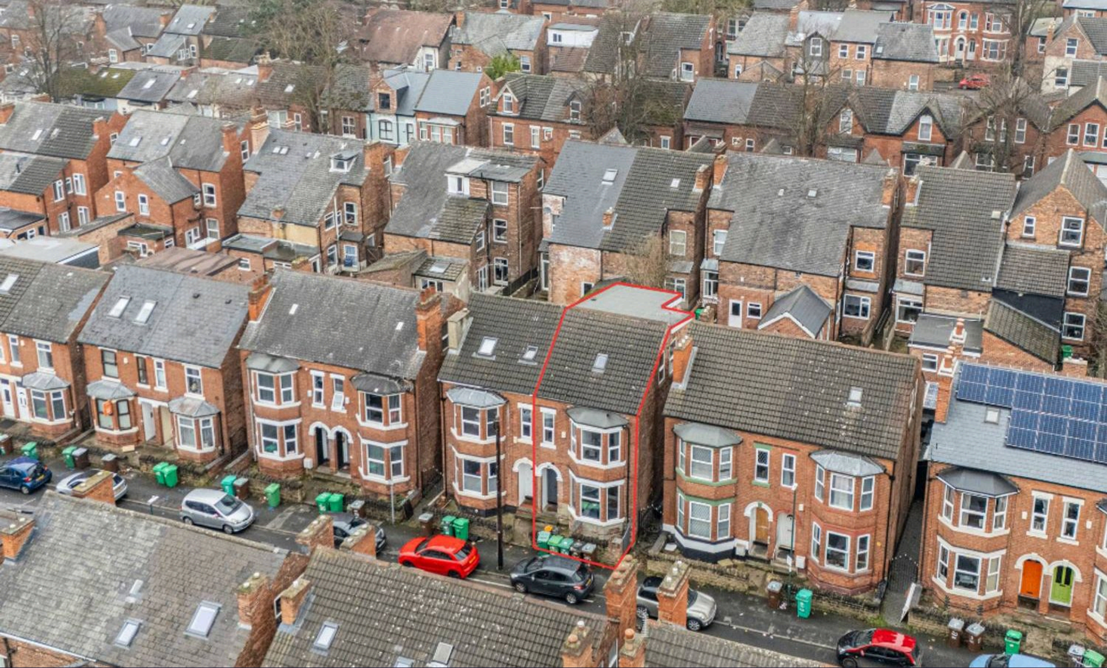
Lenton Triangle Portfolio, Trinity Avenue, Nottingham £3,096,000