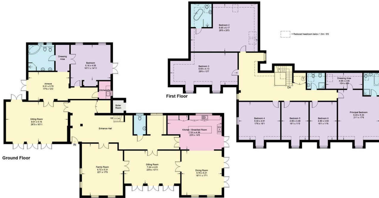
Illustration for identification purposes only, measurements are approximate, not to scale. floorplansUsketch.com © (ID1014261)