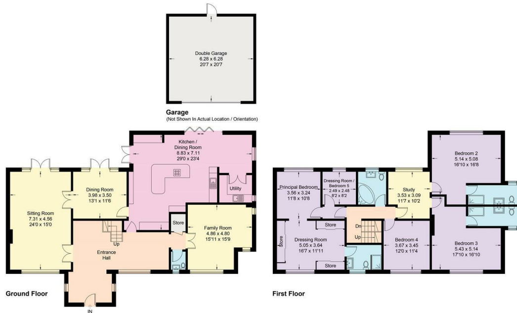
Illustration for identification purposes only, measurements are approximate, not to scale. Fourlabs.co © (ID1203067)