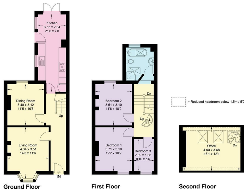
Illustration for identification purposes only, measurements are approximate, not to scale. floorplansUsketch.com © (ID1115330)