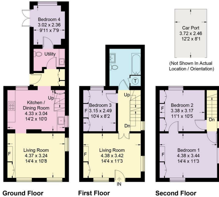
Illustration for identification purposes only, measurements are approximate, not to scale. floorplansUsketch.com © (ID1116739)