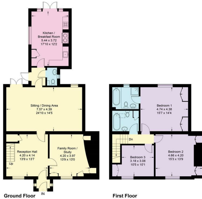
Illustration for identification purposes only, measurements are approximate, not to scale. floorplansUsketch.com © (ID1069370)