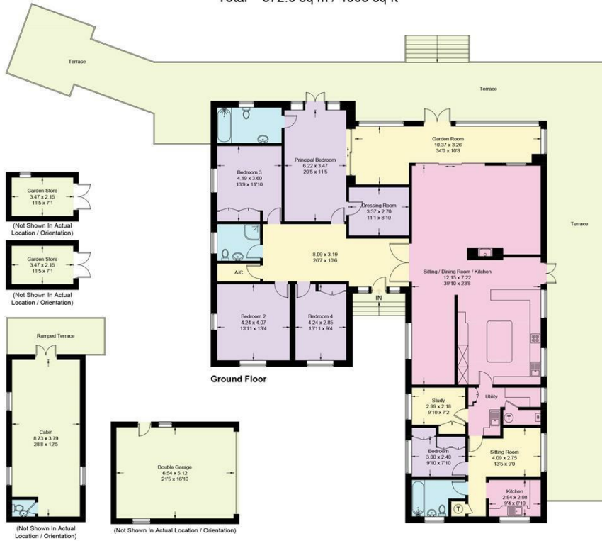
Illustration for identification purposes only, measurements are approximate, not to scale. floorplansUsketch.com © (ID1033037)