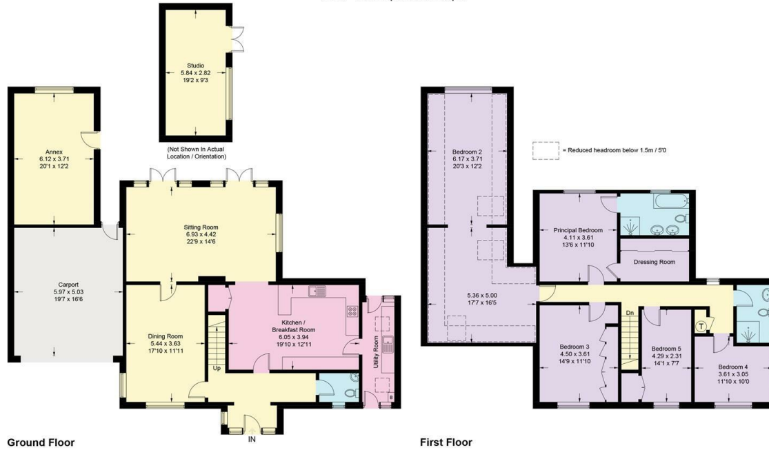
Illustration for identification purposes only, measurements are approximate, not to scale. floorplansUsketch.com © (ID1061455)