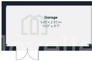
Floor 0 Building 3