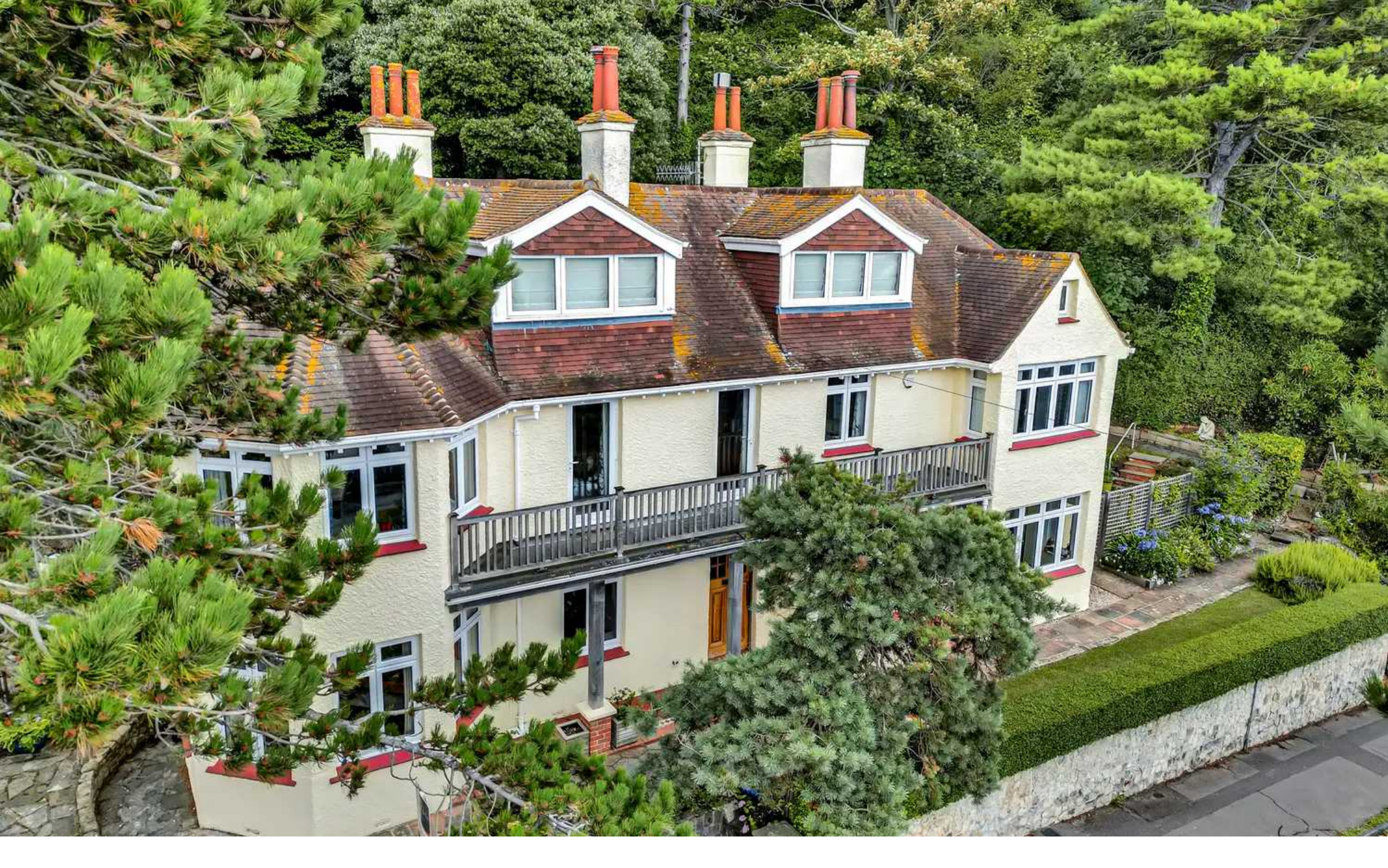
Pinehurst Radnor Cliff Crescent, Folkestone