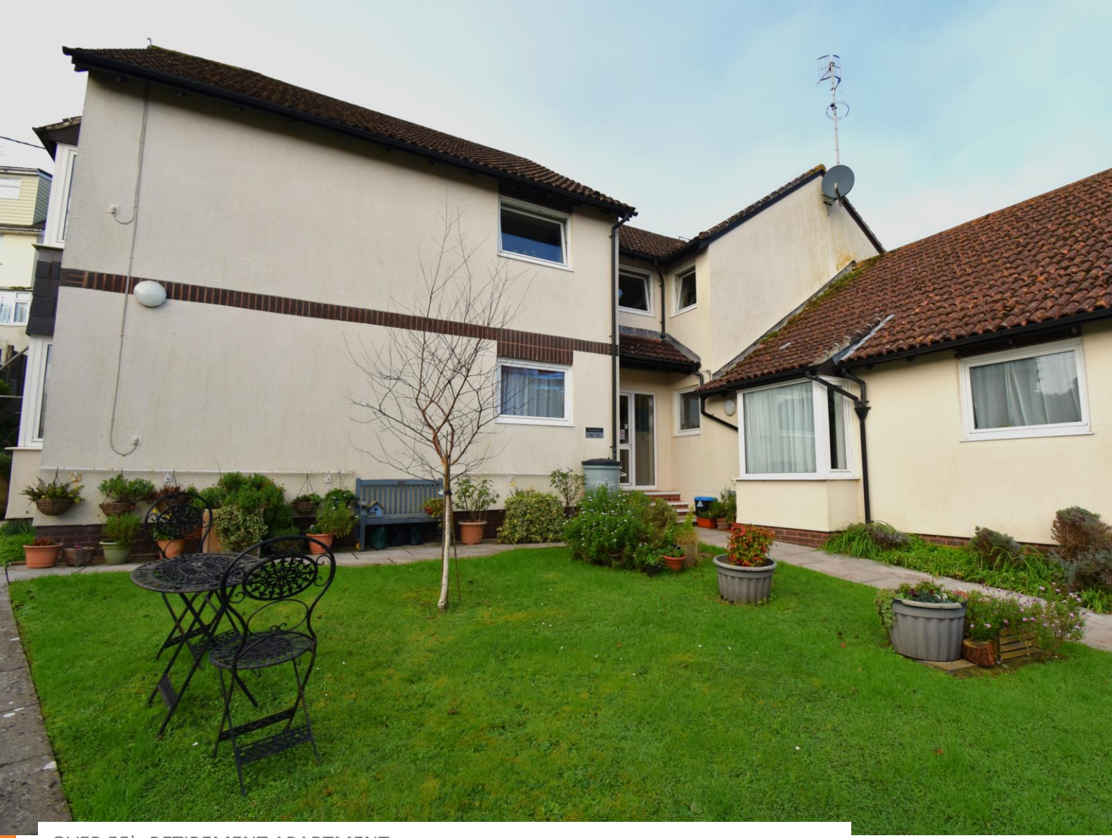
OVER 55's RETIREMENT APARTMENT

CHECK OUT this over 55's Retirement Apartment. Leasehold. Located on the edge of the Teignmouth Town Centre and set within lovely communal Gardens. 2 Bedrooms, Living Dining Room, Kitchen & Bathroom. Residents and visitors parking. NO CHAIN. No holiday let permitted. Possible Pets allowed. Local Bus, Train & Shops