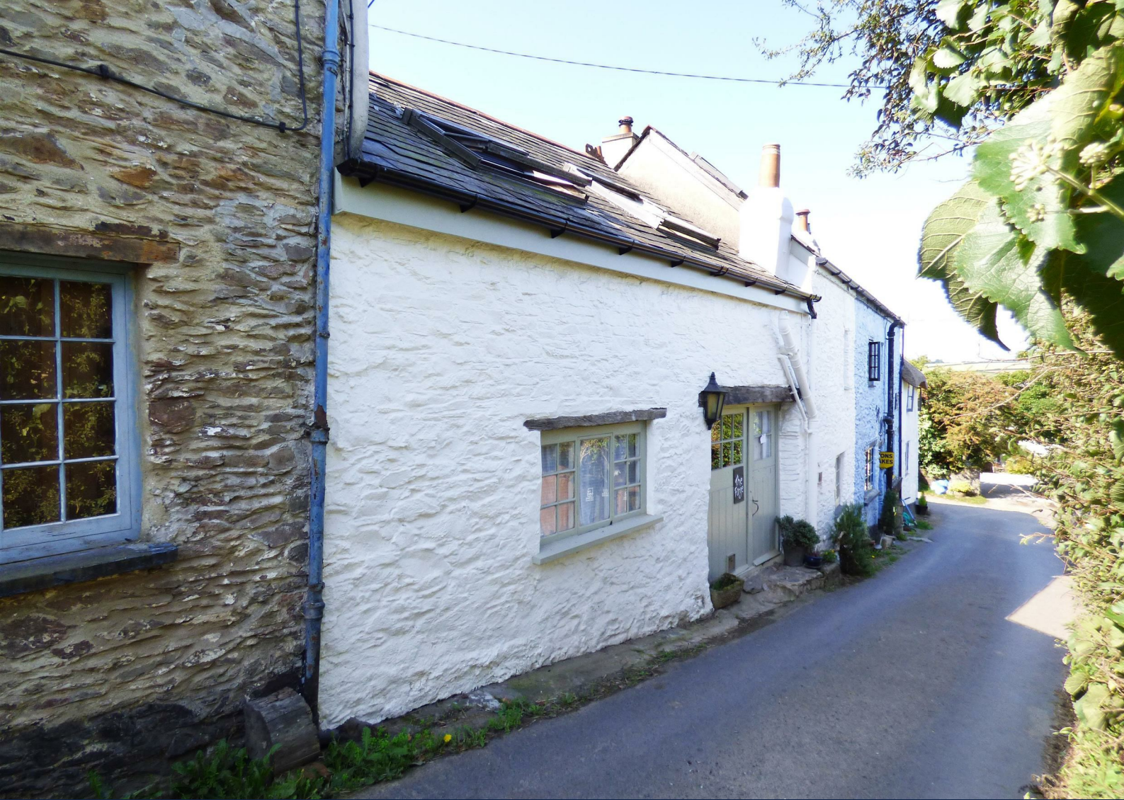
The Forge Capton, Dartmouth £230,000