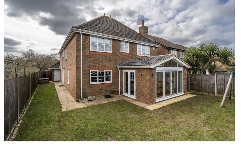
Brambles Estate Agents Ltd have not checked the suitability, specifications or working conditions of any services, appliances or equipment. The enforceability and validity of any guarantee cannot be confirmed by the Agent even though documents may exist. It should not be assumed that any fittings or furnishings photographed are included in the sale unless specified; nor that the property remains as shown in the photograph.