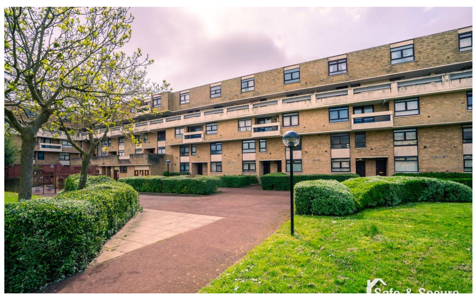
46 Neville Court