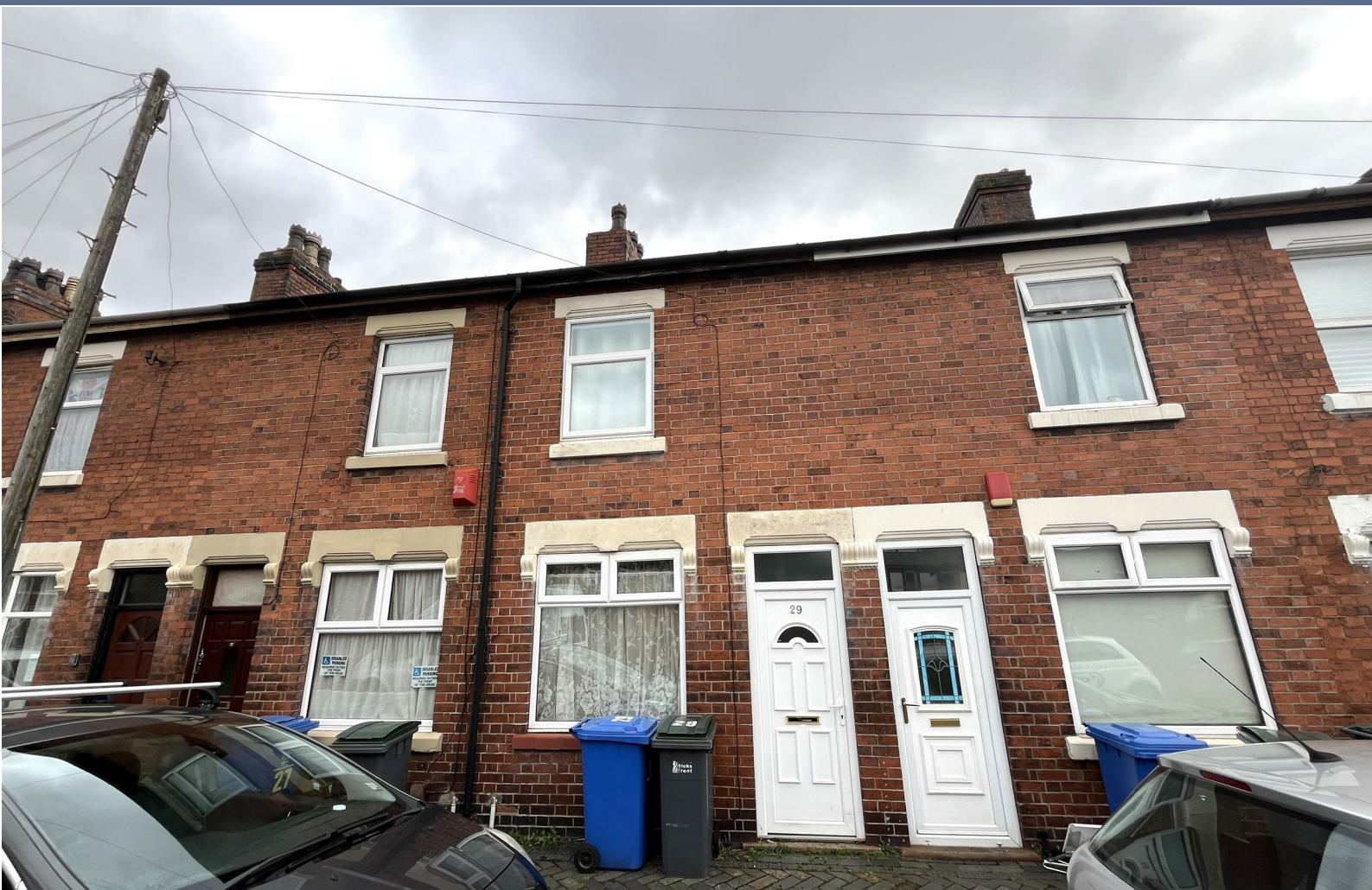
Flax Street Stoke