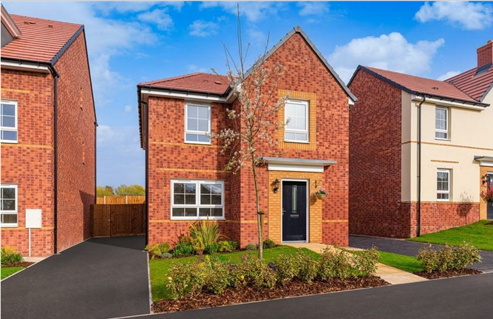
Tilstock Road Talbot Place