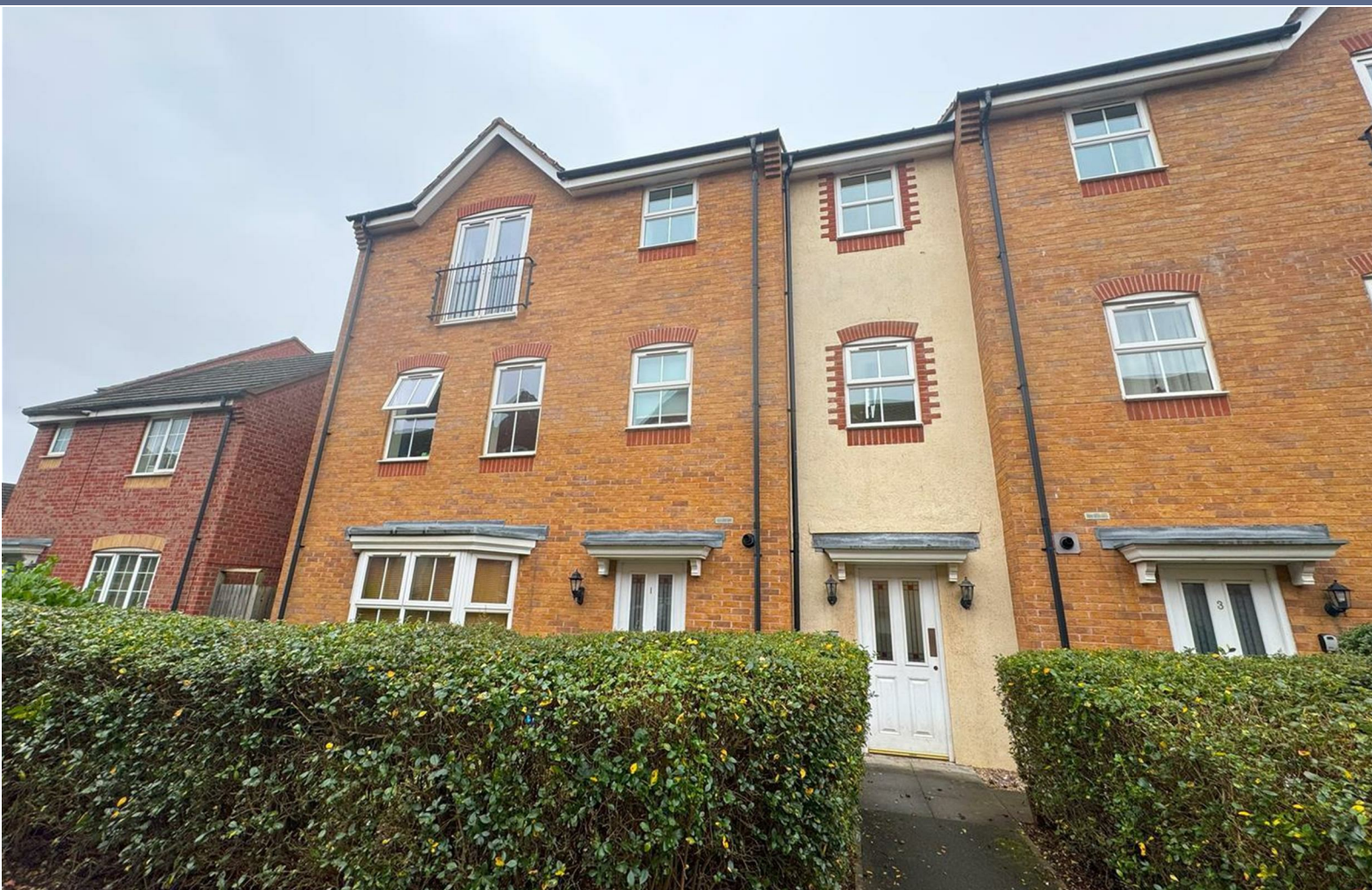
Archers Walk Trent Vale