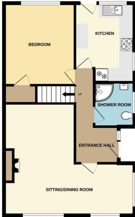
GROUND FLOOR 60.3 sq.m. (649 sq.ft.) approx.