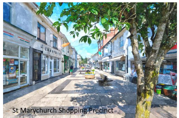
St Marychurch Shopping Precinct