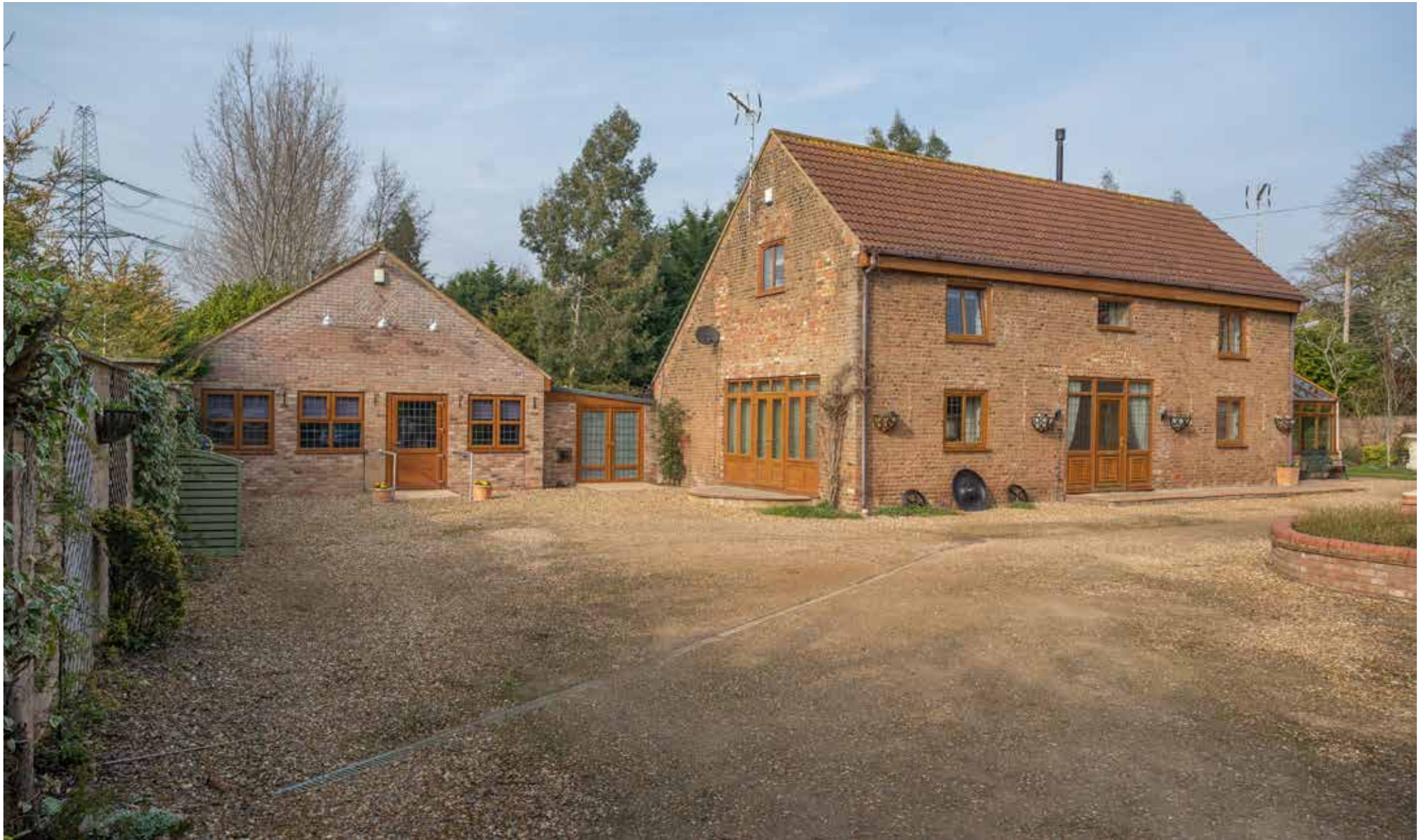
The Old Barn Walpole St Andrew | Kings Lynn | PE14 7JD