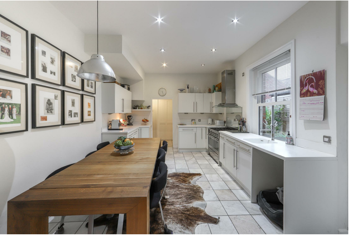
1 Ivy Road, Gosforth, Newcastle upon Tyne, Tyne and Wear, NE3 1DB £485,000

Brunton Residential are delighted to offer to the market this lovely Victorian End-Terrace with Two Reception Rooms, Generous Kitchen/Diner & Utility Room with Ground Floor WC, Four Bedrooms, Re-Fitted Family Bathroom with a Lovely Front Garden & South Facing Rear Courtyard.