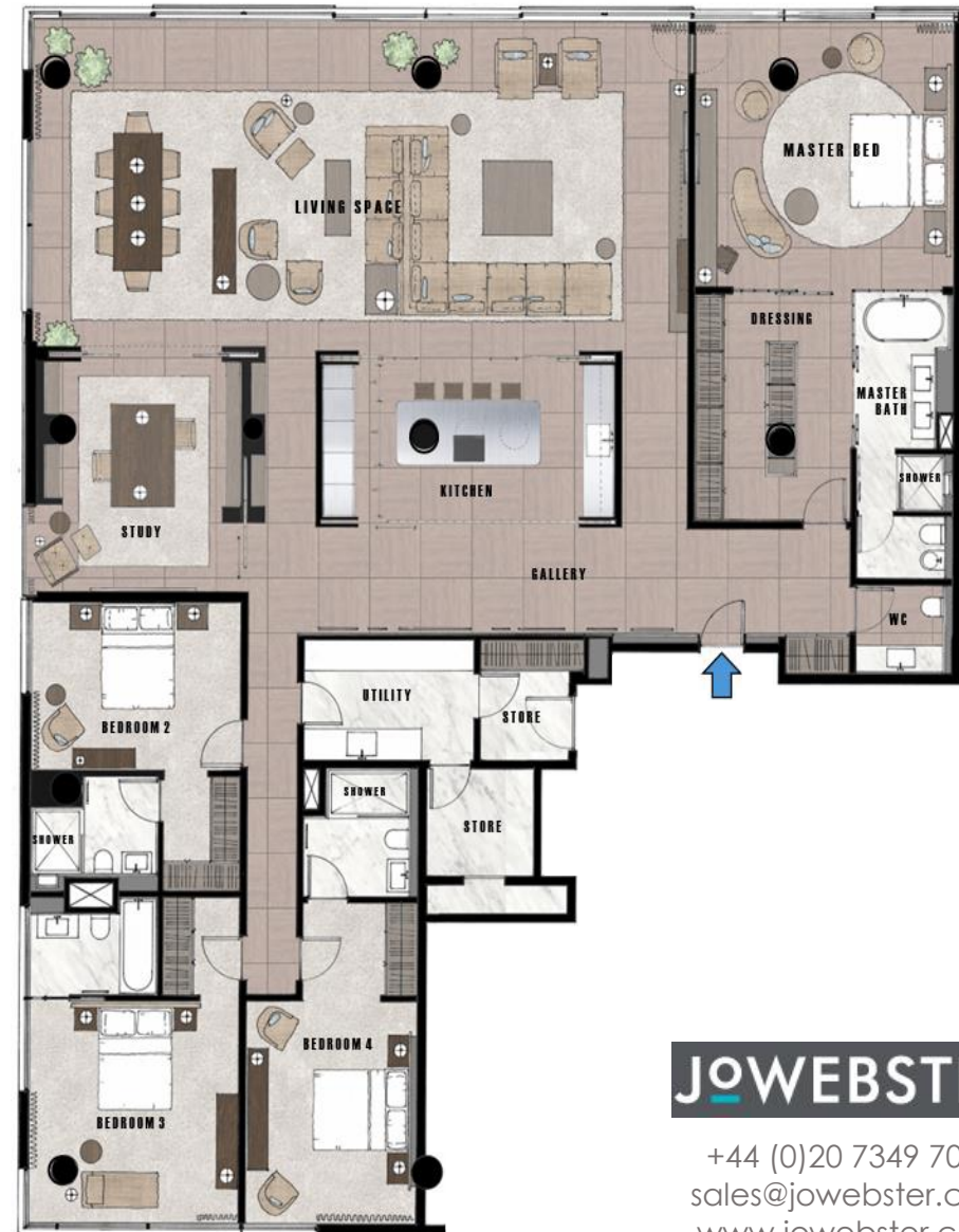
Proposed New Layout

Approximate Internal Area 3,816 sq ft/ 354 sq m