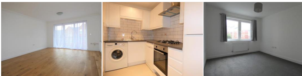
Energy Performance Certificate

Use of on-site residents' gymnasium & concierge.